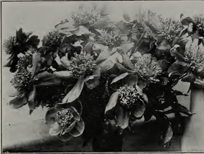
The Mikado, a good example of the Japanese type. One of the best crimsons. See page 14.